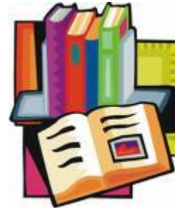
Five hours of Literacy

Ten hours of science, religious education, music, art, physical education, geography, history, design and technology and information technology.